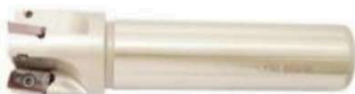
E End Mill